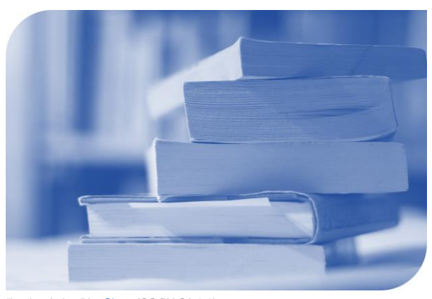
"book sale loot"