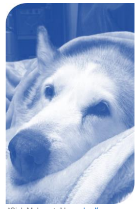
"Sick Malamute"

If you miss a test or an assignment deadline, please do not contact the instructor or a TA unless you are following the steps described here (i.e. simply telling the professor or the TA why you missed a deadline or a test does not represent proper documentation):